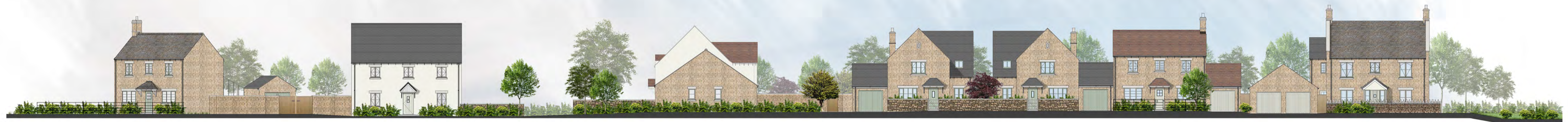
Plot 12a Plots 14/15 Plot 23 Plot 24 Plot 25 Plot 26 Plot 28