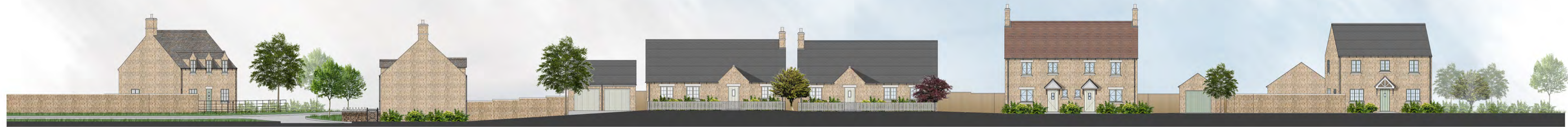
Plot 50 Plot 2 Plot 3 Plot 4 Plot 5 Plot 6 Plot 7