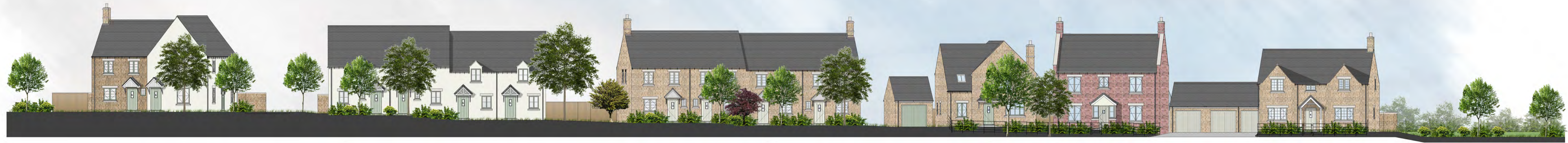
Plot 46 Plots 44/45 Plot 43 Plot 42 Plot 41 Plot 40 Plot 39 Plot 38 Plot 37 Plot 36 Plot 30 Plot 31 Plot 32