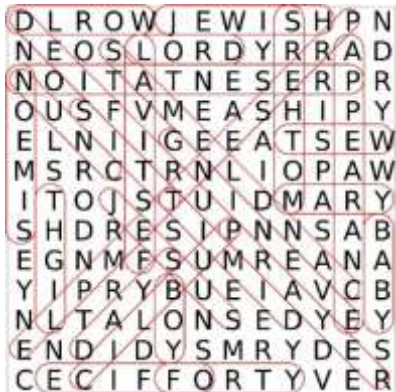
Word search is on page 10