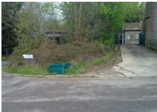
Outdated sewage pumping station

We are planning to construct a new pumping station in private land off Badsey Lane, with a pumped sewer in Badsey Lane and the B4632. Our work will also involve constructing new larger sewers in Badsey Lane and Collin Lane, and will require temporary highway closures of Badsey Lane , Collin Lane and the B4632 as shown on the plan overleaf.